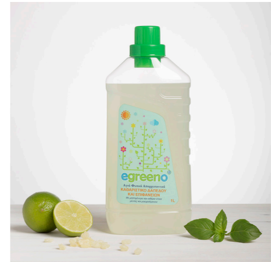
Floor and surfaces cleaner with mastic water and peppermint and lime essential oil / 1L