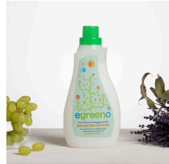
Fabric Softener with white vinegar and lavender and eucalyptus essential oils / 26 loads (970ml)