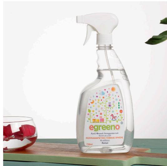
All-purpose multi-cleaner with rose water, fragrance-free / 750ml