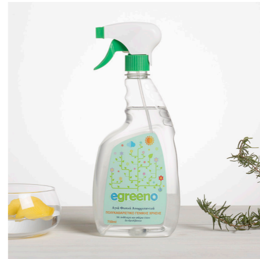
All-purpose multi-cleaner with flower water and rosemary essential oil / 750ml