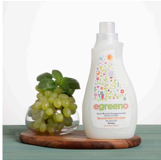
Fabric Softener with white vinegar, fragrance-free / 26 loads (970ml)