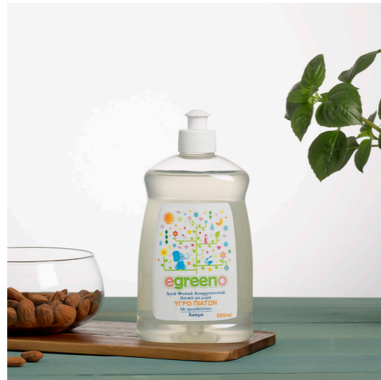
Dishwashing liquid with almond oil, fragrance-free / 500ml