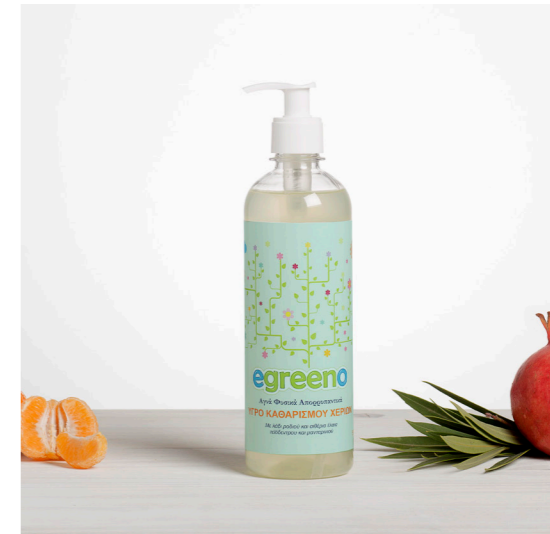
Hand washing liquid with pomegranate oil and tea tree and mandarin essential oils / 500ml