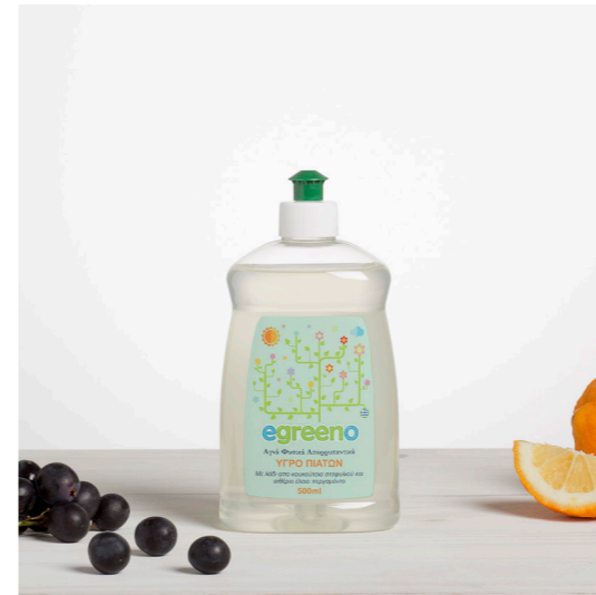
Dishwashing liquid with grape seeds oil and bergamot essential oil / 500ml