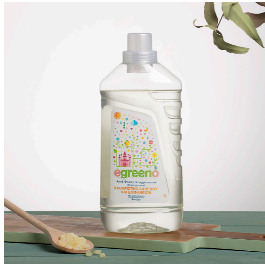
Floor and surfaces cleaner with mastic water, fragrance-free / 1L