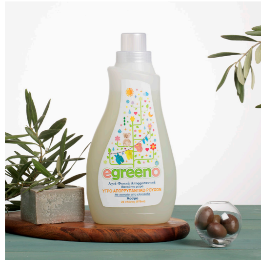
Laundry detergent with olive oil soap, fragrance-free / 26 loads (970ml)