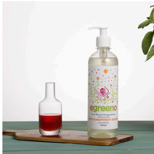
Hand washing liquid with St. John's wort oil, fragrance-free / 500ml