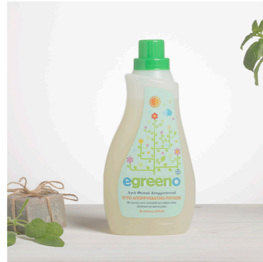
Laundry detergent with olive oil soap and basil and sage essential oils / 26 loads (970ml)